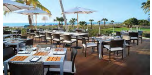
The Deck at 560