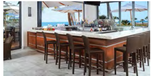
The Bar at 560